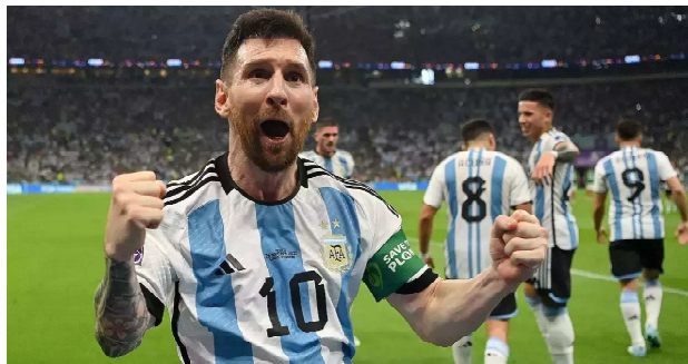
Lionel Messi celebrates after scoring.

The Barcelona forward struck in the 82nd minute to ensure the victory for Poland, who move to the top of the group with four points.