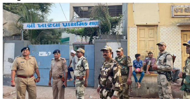
The security personnel deployed in Porbandar ahead of first phase of elections. (a representational image)